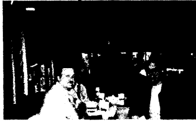
Several Members of GRSC meeting for impromptu lunch at Rush's Restaurant